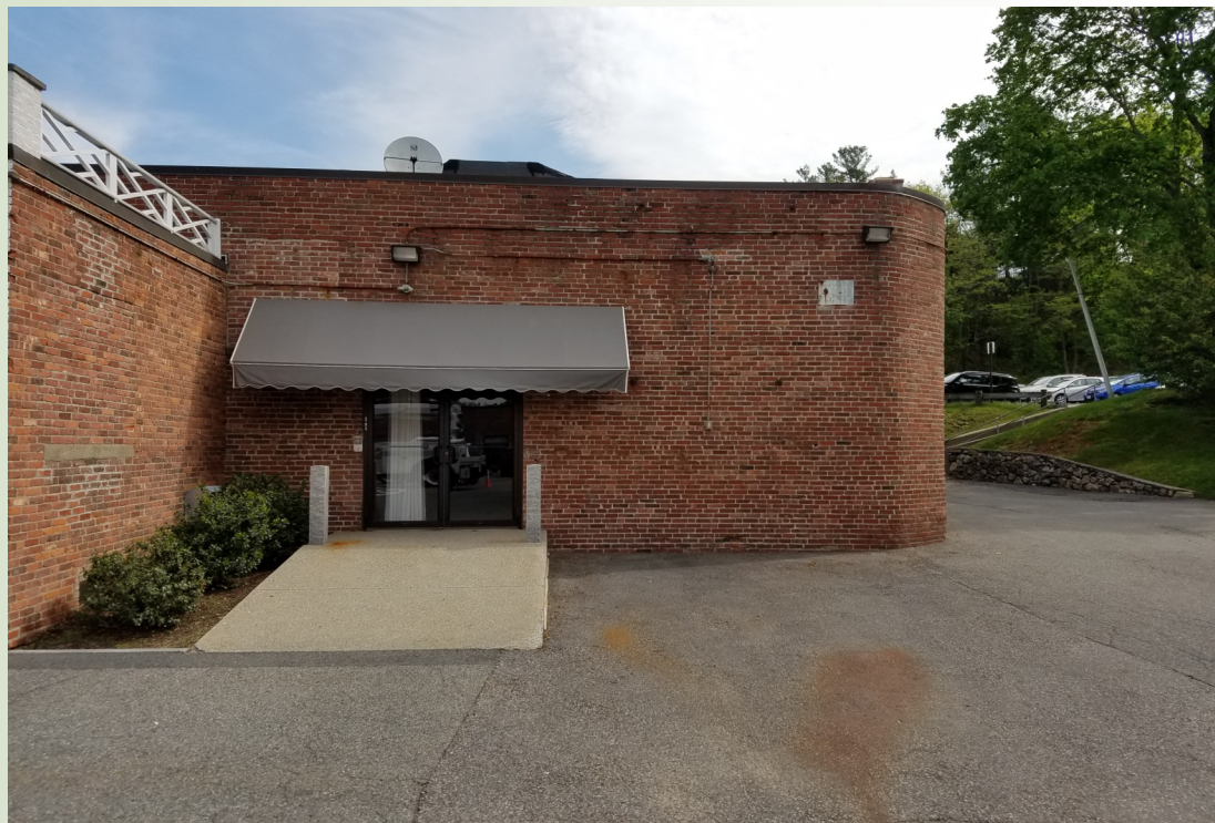
1,665 SF Entrance