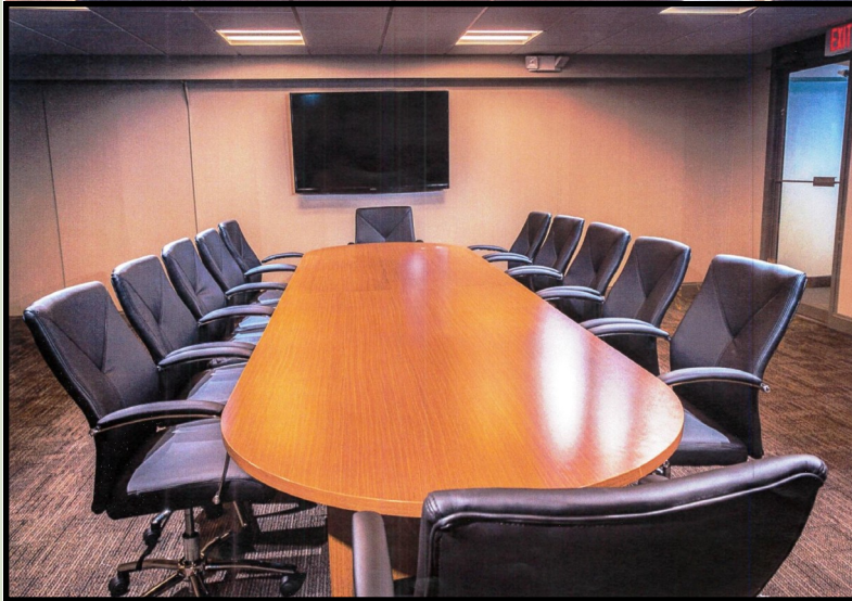
36 Washington Street, Wellesley Hills

Newly designed Conference space available to rent for a FULL or \frac{1}{2} Day